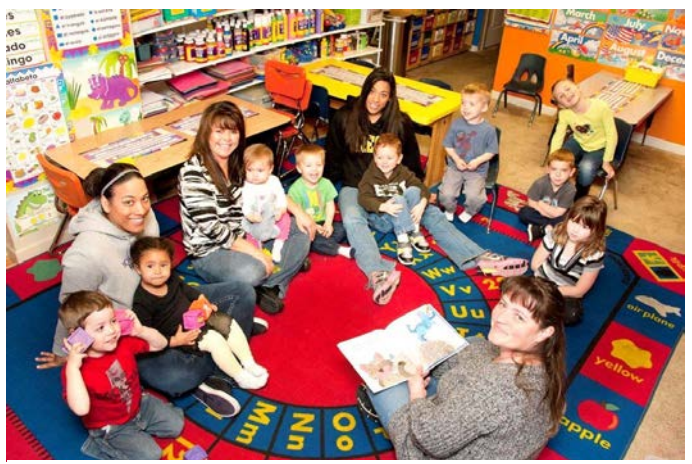
Parents and children participate in a play and literacy group.

The Hubs also play a pivotal role in engaging underserved families in prenatal through third grade (P–3) alignment efforts and children's transitions to school. For example: