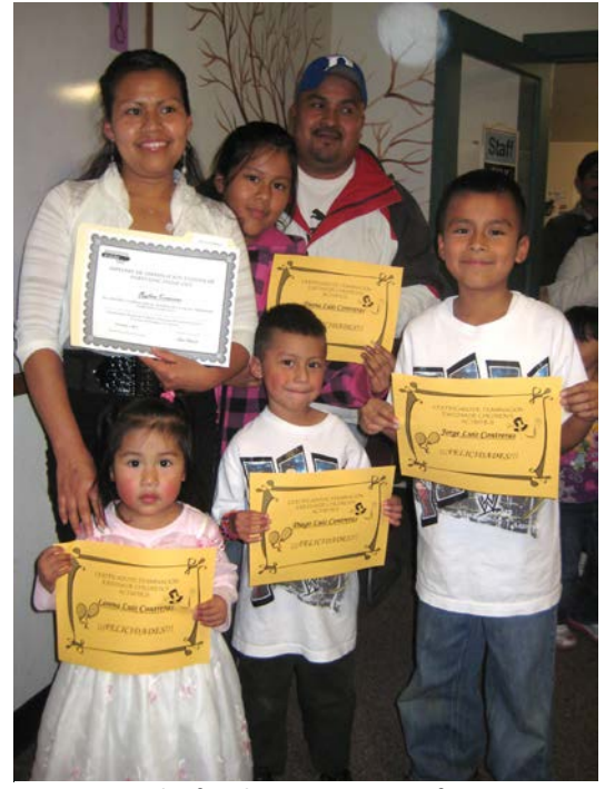
Everyone in the family receives a certificate celebrating completion of a parenting class offered by an OPEC grantee, Pathfinders of Oregon.

OPEC consists of "Parenting Hubs" that aim to provide high-quality programming for parents, create the necessary infrastructure for parenting education, and build collaborative partnerships.<sup>29</sup> Parenting Hubs coordinate parent workshops, family events, classes, and home visits to serve all parents and families in a community. To date, about 80 percent of the state's counties have an active Parenting Hub.<sup>30</sup>