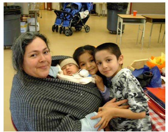
A mother participated in a parenting class offered by an organization that partners with a Parenting Education Hub in Oregon.

Although these integrated approaches are desirable, they can be challenging in practice. If the two types of hubs are not aligned geographically, it may be difficult to implement blended strategies and funding streams. There are also differences in the types of children and families served. While Parenting Hubs serve a universal population, Early Learning Hubs focus efforts on